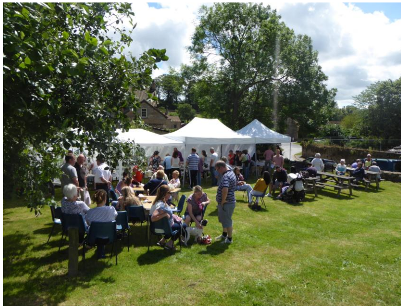
A great turnout at Ruston Green