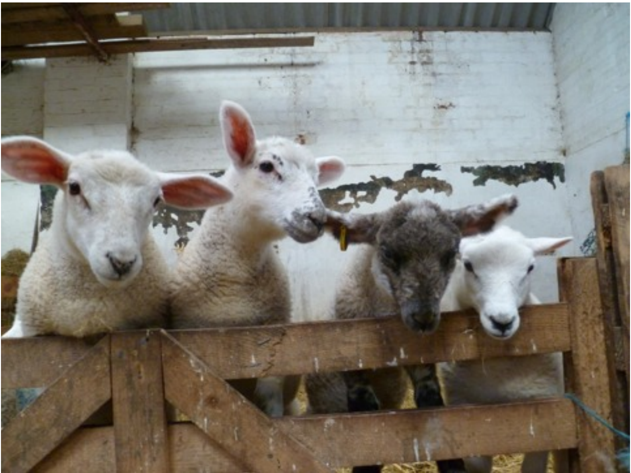
Spring lambs

The village newsletter of Wykeham, Ruston and North Moor LOCAL NEWS FOR LOCAL PEOPLE