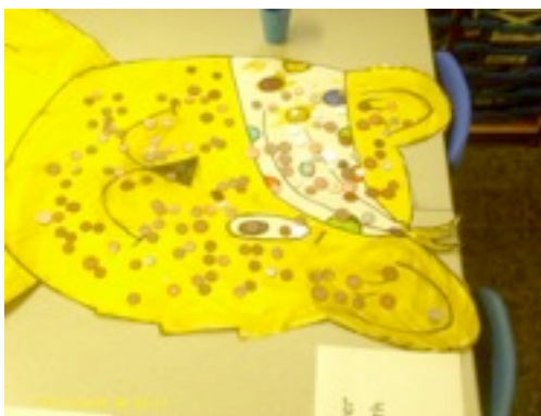
The children raised £300 for Children in Need!

Our Open Day took place on 20 November where we had the opportunity of showing prospective parents our school. Our new reward system has been very well received and we look forward to Robert Goodwill MP visiting School in early January to hear more about it!