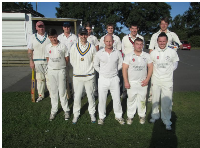
Evening League B Team