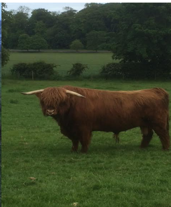
Alasdair of Auchtenny