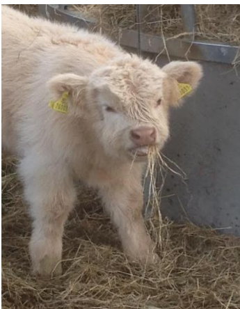
Edward Geal of Ruston

He is 4 years old and is the current Royal Welsh Show Champion, so is a bit of a looker. He has been used to being showed, so is a very quiet and calm bull and likes a tickle under his chin. He won't have any 'work' to do until next summer, but we are hopeful that he will produce some cracking calves for us in the years to come.